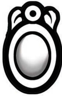
PRINCESS JEWEL PENDANT